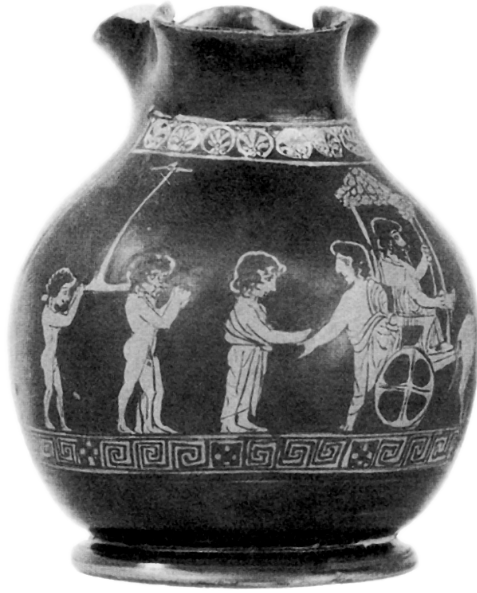
Fig. 3: Dionysian rituals at the Choëis (day of libations): bare tropaeum on ferculum (left) and seated Dionysus idol in carriage (right). 70

Three young men continue to carry the ferculum sustaining the tropaeum , but now sans idol, which has been seated in the carriage and is already carted to the next station of the rite.