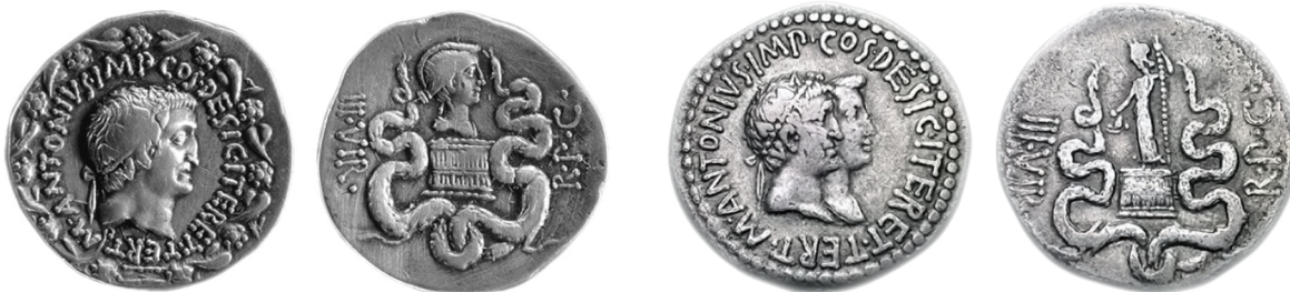
Fig. 5: Coin of Antony with ivy wreath; v: Octavia on cista mystica .

The same ivy motif—or Dionysus himself—figures prominently on contemporary coins of Antony, a motif that he retained even after Fulvia's death and his marriage with Octavia (figs. 5, 6).