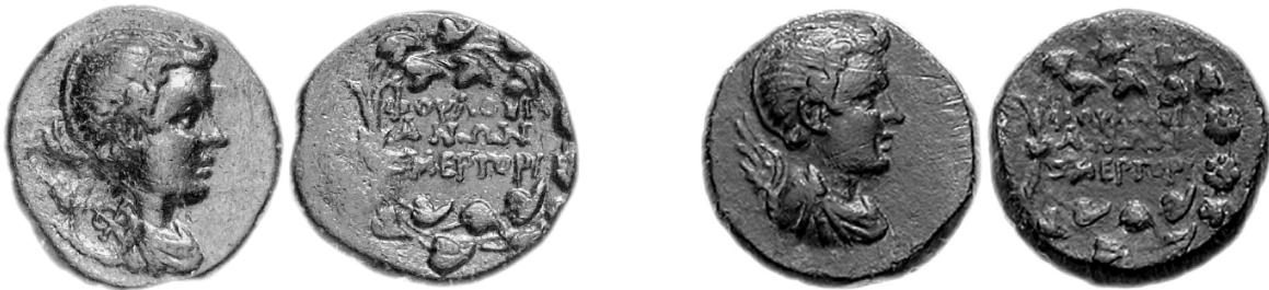
Fig. 4: Coin of Fulvia, winged; v: wreath of ivy (leaves and berries). 102

with incense and solemn chants, but also with lamentation. 100 Following the Dionysia a festival was celebrated in his honor on the 17 th of Anthesterion , the Antôniaia . 101 Coins of his wife Fulvia, the possible director of Caesar's ceremony, have been preserved, which show her as a winged Nike with Dionysian motifs like ivy (fig. 4). They were minted by the Phrygian city of Eumenia , which was renamed Fulvia in her honor and was the twin city of Dionysopolis . The city had already minted coins of Dionysus in the past, and also its name was well suited, for Eumenides ("The Merciful") was the alternate name for the Erinyes, the Furies and goddesses of vengeance—bloodthirsty and maternal at the same time.