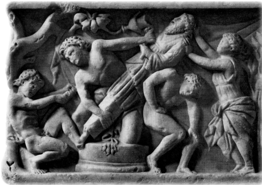
Fig. 2: Erecting of a Dionysus idol or of its herm. 69

We can see from the vertical pole visible at the bottom that the Dionysus idol consisted of a dressed-up tropaeum with a mask (fig. 1). The pole stabilized the tropaeum either in the ground or inside a round base (fig. 2) which then also allowed for a possible rotation.